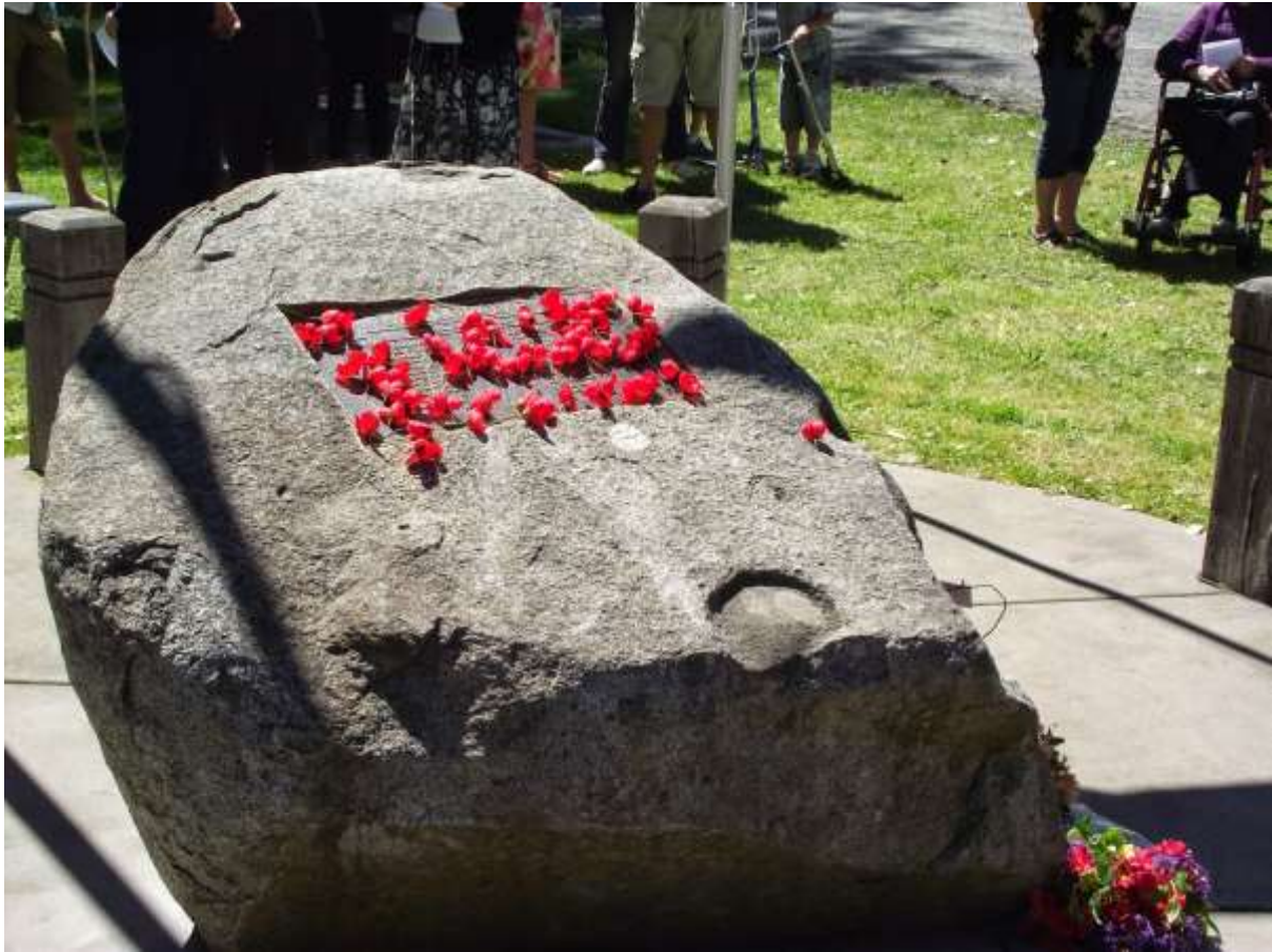
The Millgrove Memorial