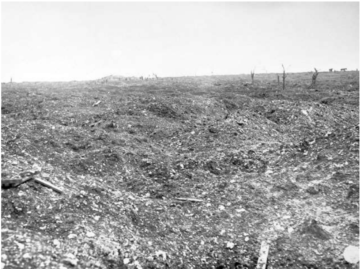
Mouquet Farm in October 1916

Today, Mouquet Farm is a working farm again and there is a memorial to the fallen nearby