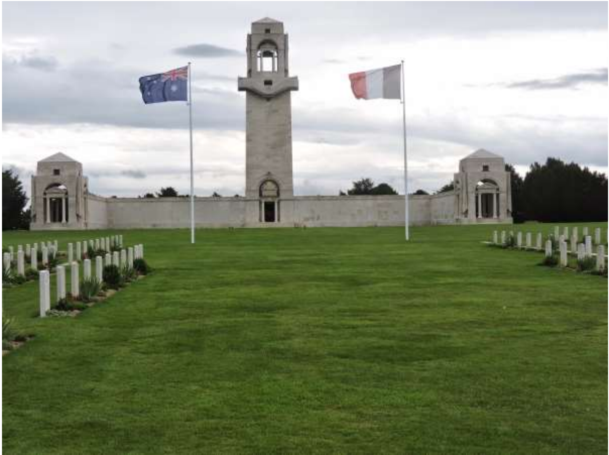
The Australian National Memorial at Villers-Bretonneux