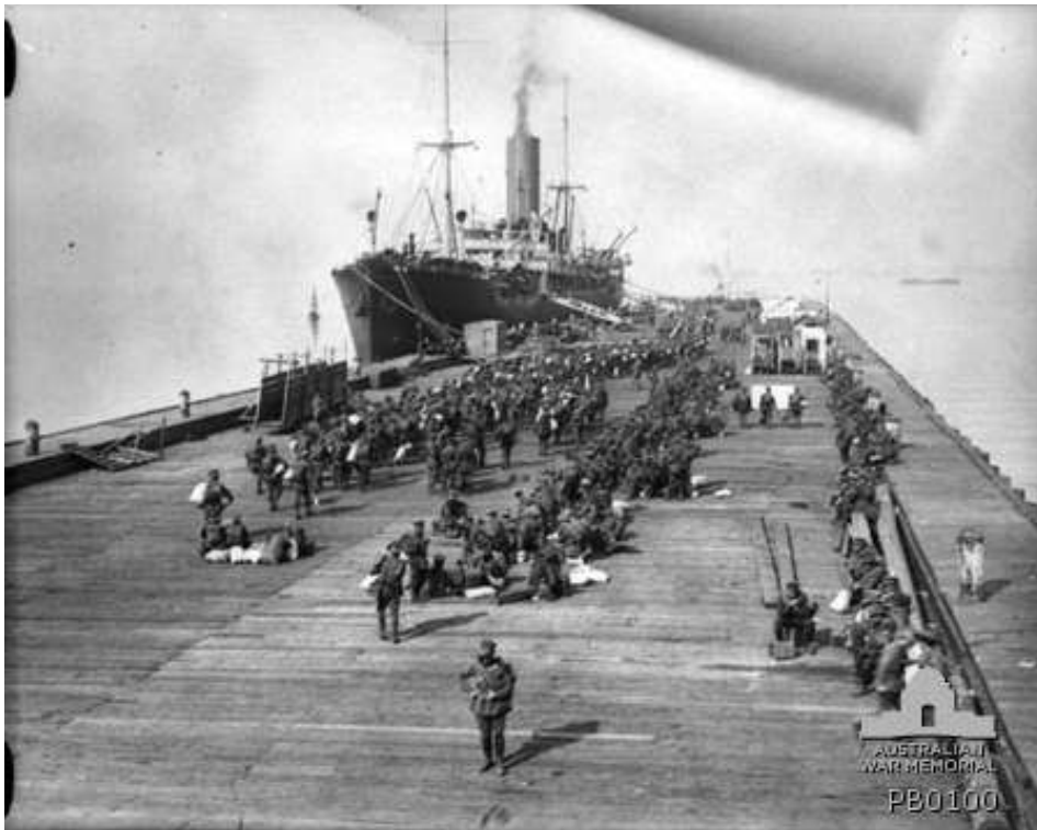
Troops waiting to board HMAT Anchises in March 1916.