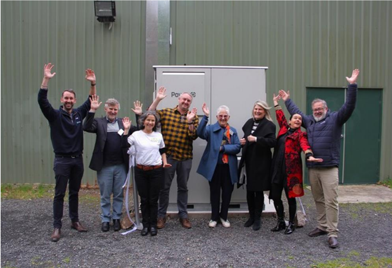
Photo of the MRAG team and AusNet team in front of the Millwarra Centre battery