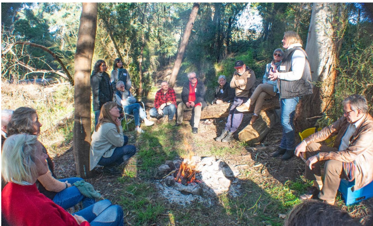
Photos above, Workshop participants.